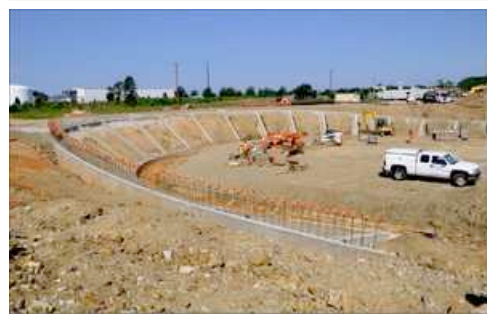
The Giordana Velodrome is under construction as part of the Riverwalk development in Rock Hill. City officials hope to open the cycle racing track on Jan. 1.